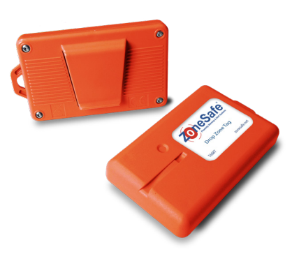
Drop Zone Tags (Rechargeable)